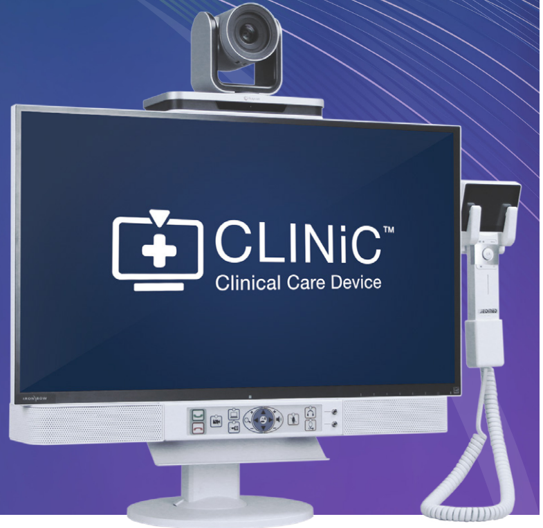
* shown with optional Horus Scope

A purpose-built telehealth consultation device